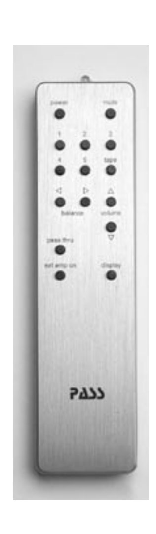
You are ready to play music

It's always possible that something may go wrong. If so, don't get excited. We know It's really aggravating when a product doesn't work, but it will get fixed, and often it's something really simple.